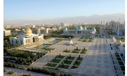
Impression of Ashgabat – capital city of Turkmenistan

The produced films are taken for internal use for thermoforming as well as the sales within Turkmenistan and other CIS staates. For that, a prospective customer already could be found: A russian customer is gladly willing to buy the films from our turkmenistan partner with the mediation from KUHNE.